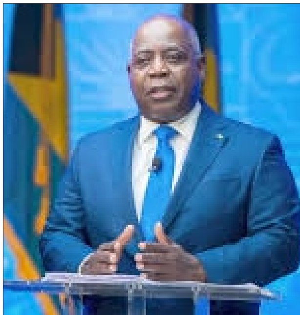
Prime Minister Hon. Philip Davis KC