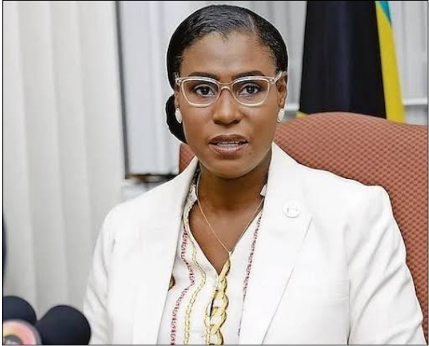
Minister of Labour, Public Service and National Insurance Hon. Pia Glover-Rolle