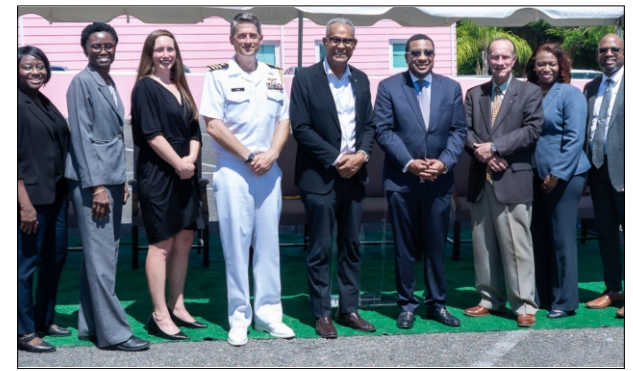
Ministry of Health and Wellness officials are photographed with representatives of the U.S. Embassy Donation