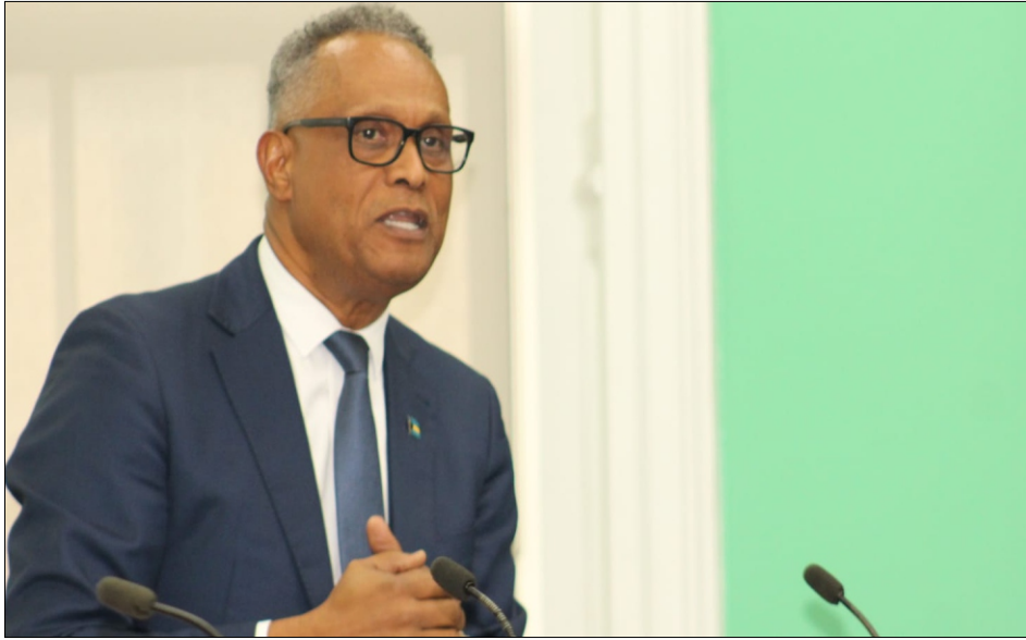
Health and Wellness Minister Hon. Dr. Michael Darville