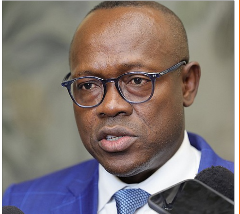
Deputy Prime Minister, and Minister of Education, Science, and Technology, Hon. Chester Cooper

The minister also said school repairs are scheduled for this summer. "As is required by the normal wear and tear of the system, we have already begun that process, we anticipate that it going to be completed by September," he said. "And we are looking to see how we could change the approach to ensure that there is not such a mad rush during the summer months," Cooper explained. He added that they are looking to build more internal capacity so some