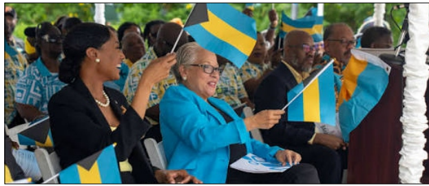
Minister of Culture, Arts, and Heritage Hon. Leslia Miller-Brice and Minister of Tourism Hon. Glenys Hanna-Martin

Minister of Tourism Hon. Glenys Hanna-Martin echoed similar sentiments, adding that independence is a