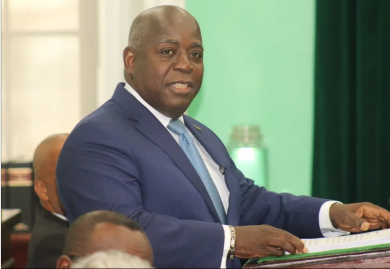
Prime Minister Hon. Philip Davis KC