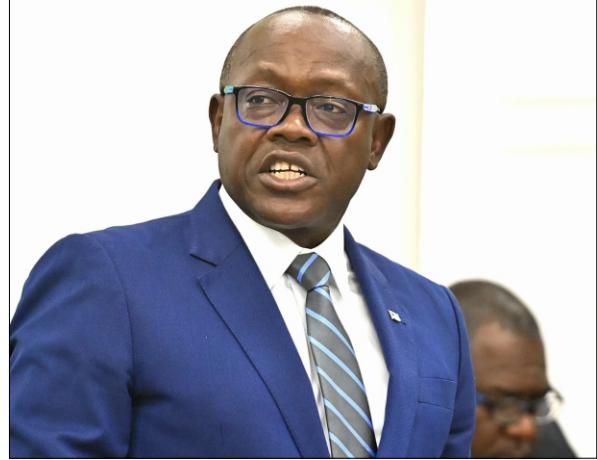
Deputy Prime Minister, and Minister of Education, Science, and Technology, Hon. Chester Cooper