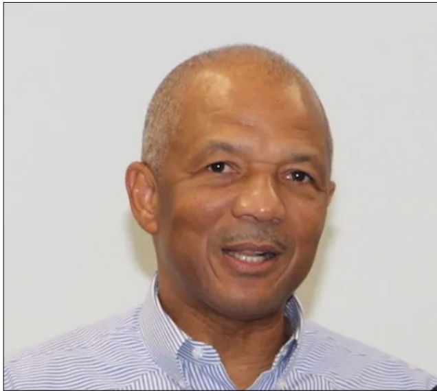
National Security Minister Hon. Myles LaRoda