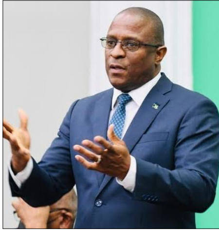
FNM Leader, Michael Pintard

Following the results of the general election where the FNM won just eight of the 41 seats Mr. Pintard said there are "no sour grapes, no crying over spilled milk."