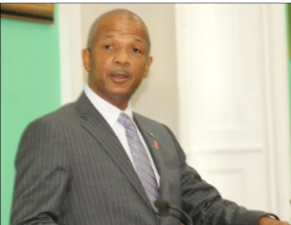
National Security Minister Hon. Myles LaRoda