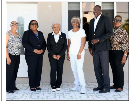
Minister of Social Services, Senator the Hon. Barbara Cartwright

Minister of Social Services, Senator the Hon. Barbara Cartwright made her first visit to Grand Bahama, June 16, 2026 since assuming her new portfolio.