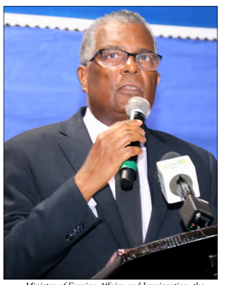
Minister of Foreign Affairs and Immigration, the Hon. Frederick Mitchell

On what was the first Prize Giving Ceremony for the Holmes Rock Junior High School (HRJHS) since opening its doors in September 2025, the Class of 2026 was celebrated on June 15, 2026 at the Eight Mile Rock High School Gymnasium as trailblazers on such an historic occasion.