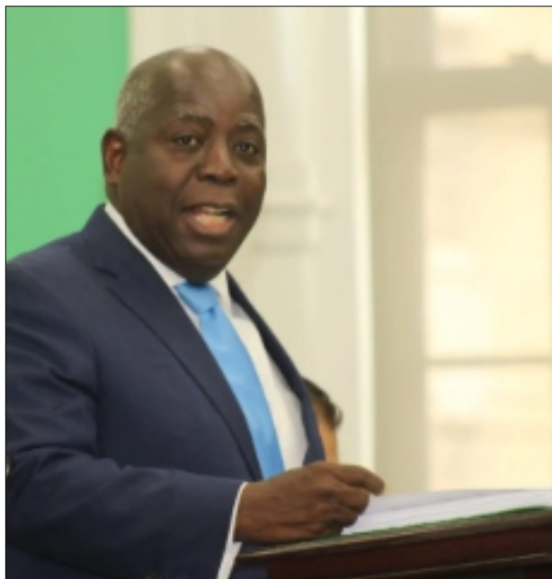
Prime Minister Hon. Philip Davis, KC