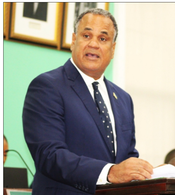
Minister of Finance Hon. Michael Halkitis

Mr. Halkitis said, this fee is consistent with the amount that would ordinarily be payable when applying for permanent residency and "is not a hidden pathway to permanent residency, but rather an administrative charge associated with transferring from the citizenship track back to residency status."