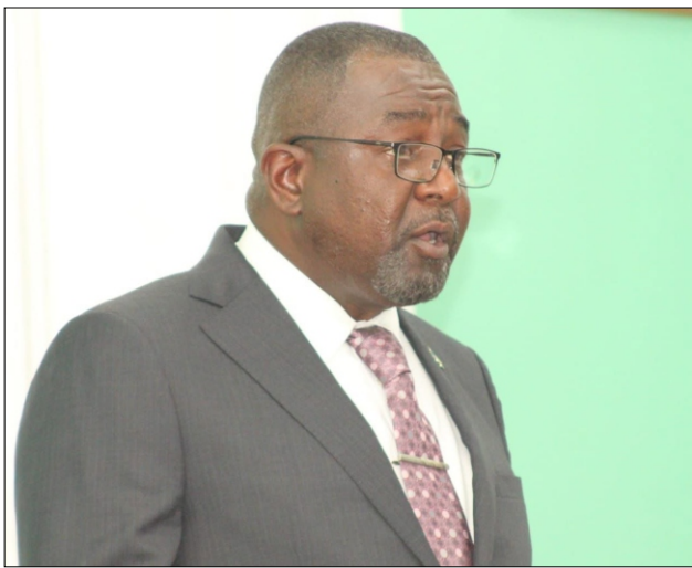
Minister of Youth and Sports, Hon. Mario Bowleg

Applications are now open for the next cohort of the National Youth Parliament, Minister Bowleg highlighted how the Government’s continued investment in training, advocacy, diplomacy, and leadership development, enables the Bahamas to have representation at both the national and international levels, participating in United Nations, Commonwealth, CARICOM, and other regional and global engagements.