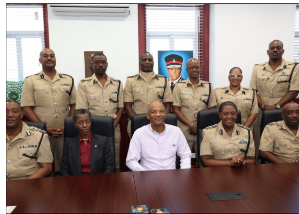
National Security Minister Hon. Myles LaRoda with the Top Brass of the R.B.P.F.