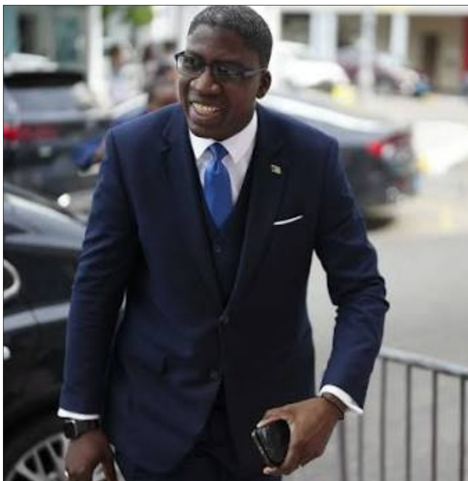
Minister of Environment and Natural Resources, Hon. Zane Lightbourne

He also addressed protecting future whistleblowers like Moxey stating that something like this is so impactful and the government wants them to know that they are appreciated and that their work does not fall on deaf ears. Lightbourne believes the government is doing their job bringing people to justice who intend to damage our environment.