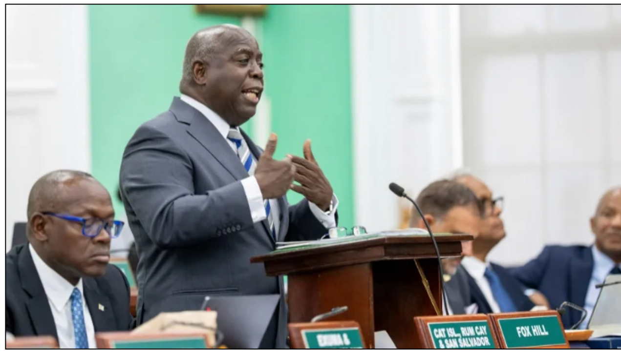
Prime Minister Hon. Philip Davis, KC