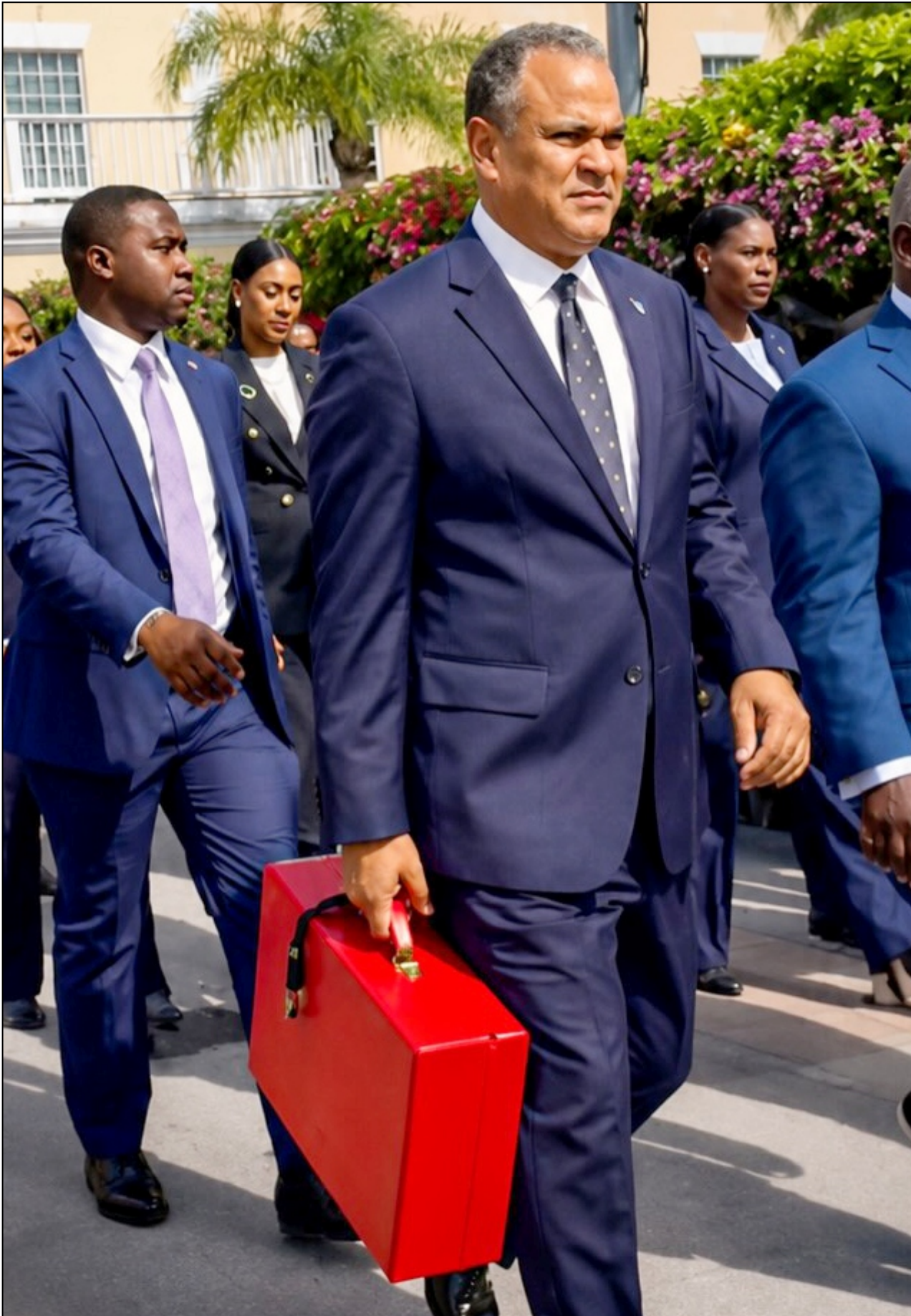
Hon. Minister of Finance Michael Halkitis