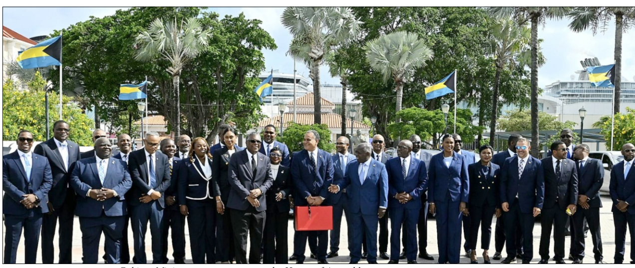
Cabinet Ministers prepare to enter the House of Assembly