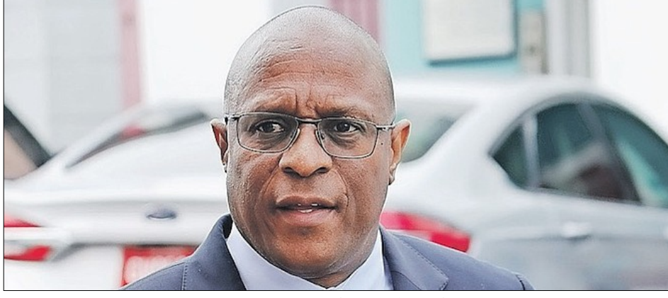
FNM Opposition Leader, Michael Pintard