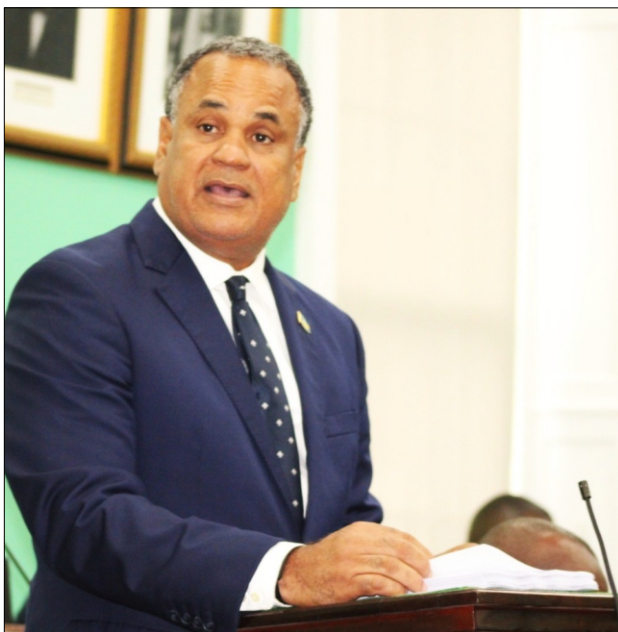
Hon. Minister of Finance Michael Halkitis

In housing, for first-time homeowners the government is expanding zero-rated value added tax to include duplexes, triplexes and fourplexes where at least one unit is occupied by the first-time homeowner. The tax relief will apply to the entire building rather than only the owner-