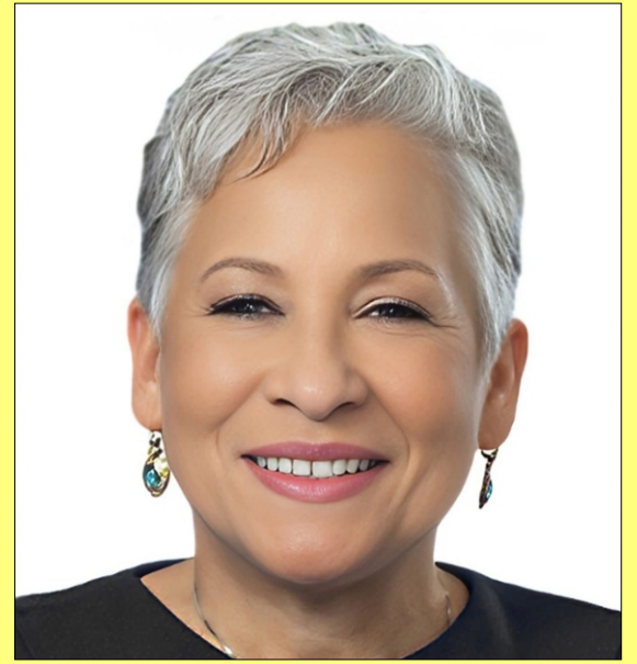
Minister of Tourism, the Hon. Minister Hanna-Martin

Minister of Tourism, the Honourable Glenys Hanna-Martin, is leading a delegation of The Bahamas to two United Nations Tourism engagements being convened in Asunción, Paraguay, from 28–29 May. This mission underscores The Bahamas' continued commitment to multilateral cooperation and its active role in advancing global tourism policy dialogue.