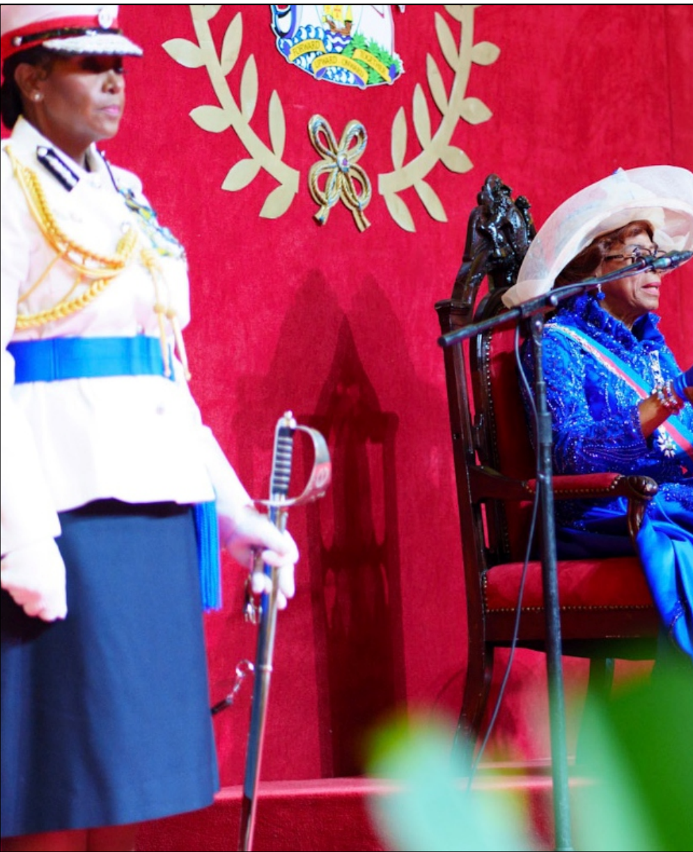
BY GERRINO J. SAUNDERS Bahama Journal News Editor

The new legislative session began on Wednesday (May 20th) with 41 members of the House of Assembly and 16 members of the Senate Taking their oaths of allegiance and the oath of qualification.