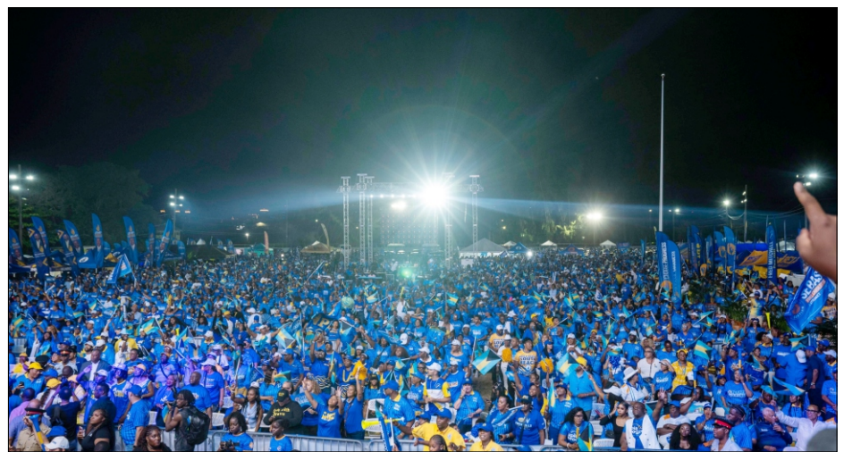
PLP Supporters photographed at the victory rally after the May 12th general elections