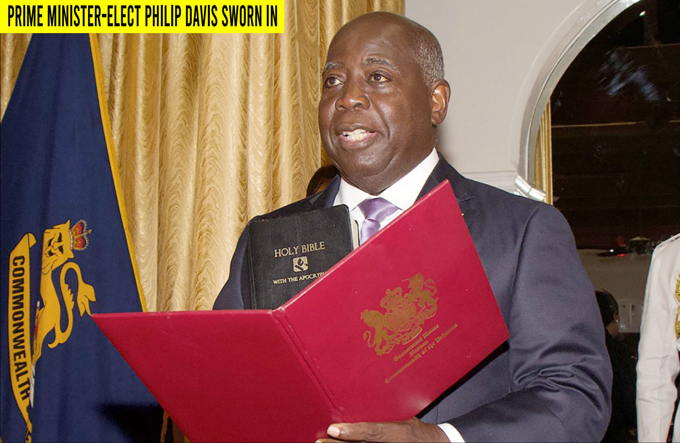
For the first time in nearly 30 years, a Bahamian Prime Minister took the oath of office to lead The Bahamas for a second consecutive term. During an elaborate ceremony at Government House attended by local and international diplomats, dignitaries and government officials, Prime Minister elect Philip Edward "Brave" Davis was sworn in by Governor-General Dame Cynthia Pratt at Mt. Fitzwilliam where he took the oath of allegiance to the people of The Bahamas, after which time he was presented the instrument of appointment. The Prime Minister is expected to announce his Cabinet today (May 15th). The new Cabinet Ministers will be sworn in as will the Leader of the Opposition. The official Opening of Parliament to begin the new legislative session is scheduled for Wednesday, May 20th. The Progressive Liberal Party won 33 of the 41 parliamentary seats while the Free National Movement won eight.

PRIME MINISTER-ELECT PHILIP DAVIS SWORN IN