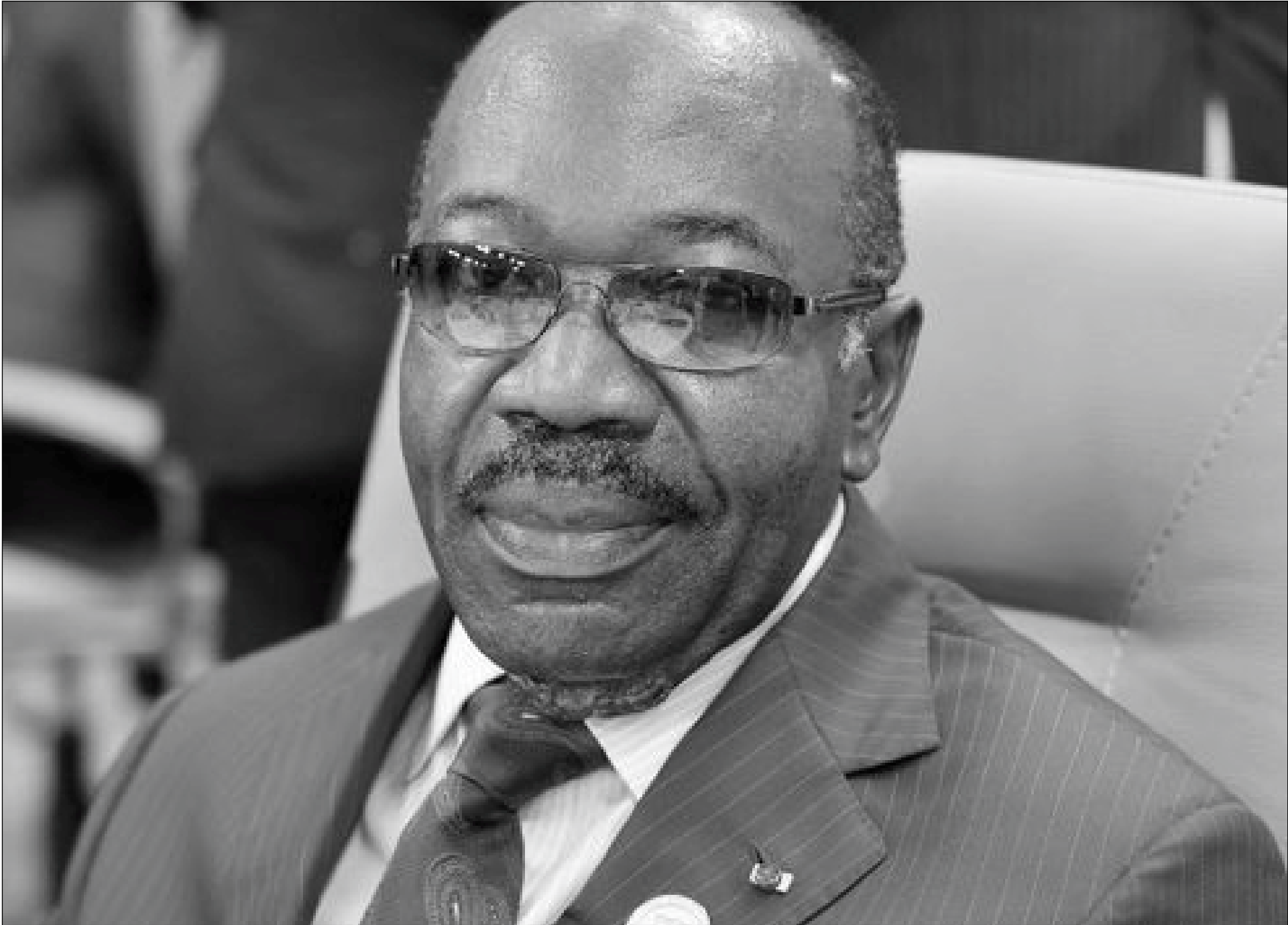
FILE - President of Gabon Ali Bongo Ondimba addresses the 77th session of the United Nations General Assembly, Wednesday, Sept. 21, 2022 at U.N. headquarters.