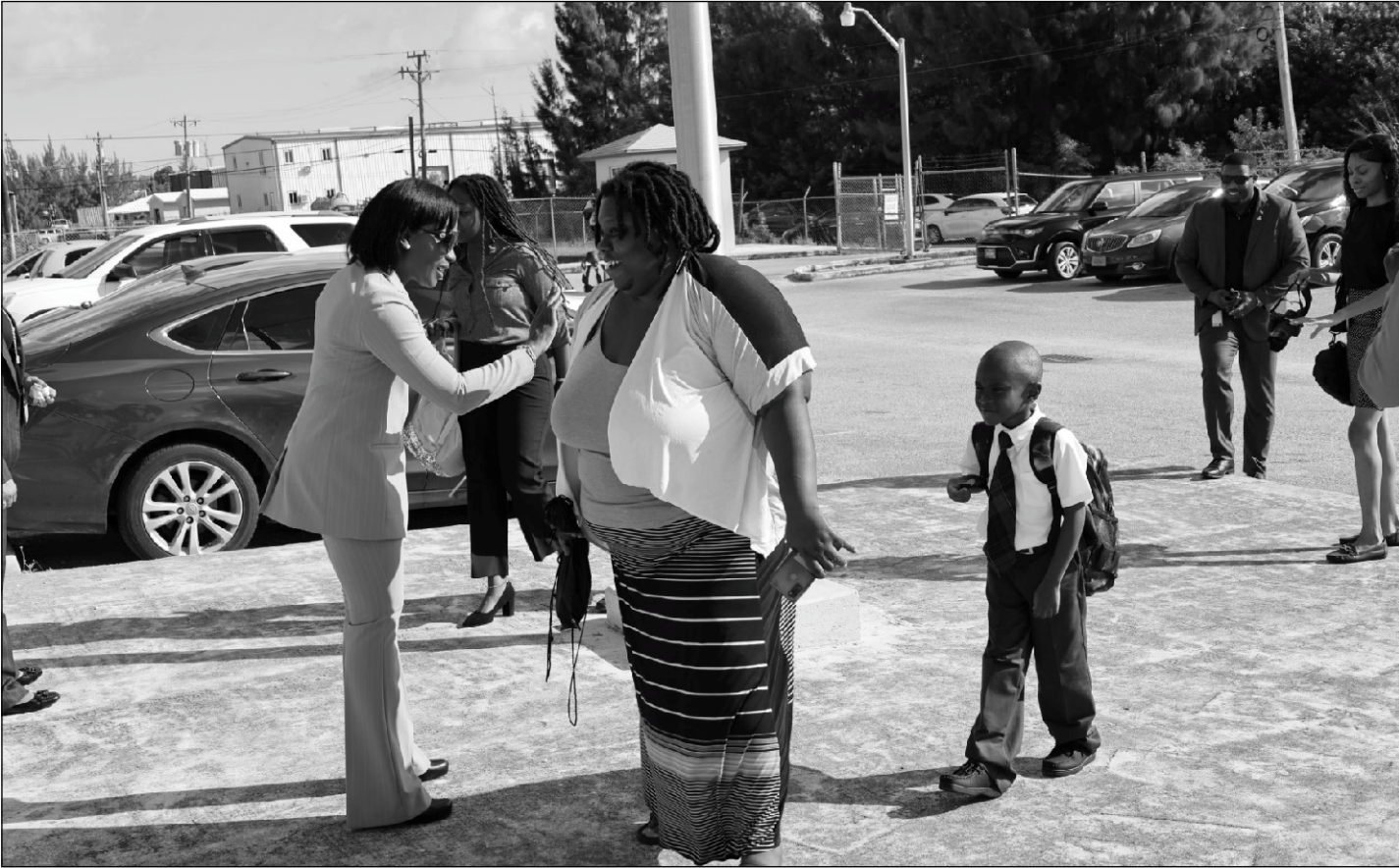
WELCOMING STUDENTS AND PARENTS – Minister for Grand Bahama, Ginger Moxey welcomed students and parents at Hugh Campbell Primary School on Monday, August 28, 2023. Minister Moxey visited a number of schools on Grand Bahama, as students returned to the classroom for the new school year.