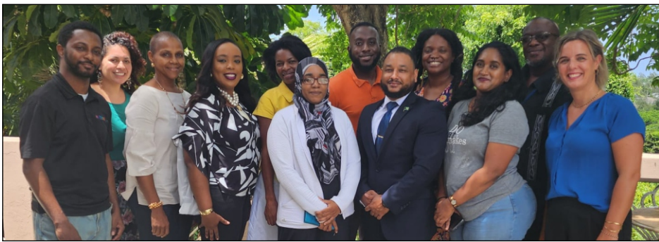
The Western Hemisphere Program and the Global Migration Media Academy, both International Organization for Migration (IOM) initiatives, hosted a two-day training for journalists in The Bahamas, August 8 - 9, to promote dialogue, share knowledge about migration data, hone their reporting skills and learn from different experts through practical sessions.

Journalists play a pivotal role in shaping the public understanding of human mobility. Journalists are also faced with the challenge of adapting to evolving phenomena, and an ever-changing and adapting vocabulary around the issue of migration. The ongoing challenges faced by Haitian and Cuban migrants and how the flows of migrants from these countries affect The Bahamas make it vital to ensure accurate and effective communication on migration issues and guarantee the right of access to information to migrants and the public.