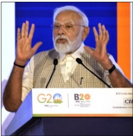
Indian Prime Minister Narendra Modi

NEW DELHI (AP) — Indian Prime Minister Narendra Modi said the country's role as the G20 host this year would focus on highlighting the concerns of the developing world, and has proposed the African Union to become permanent members of the forum.