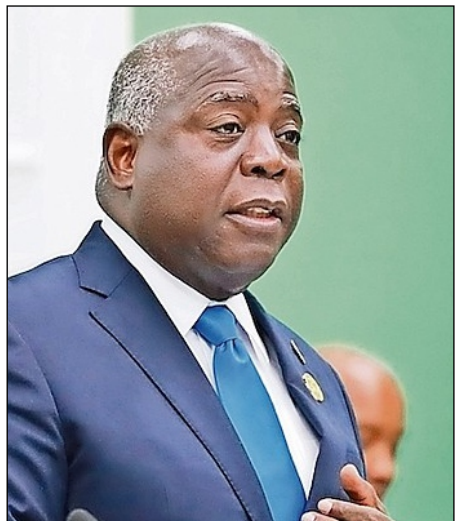
Prime Minister Philip Davis