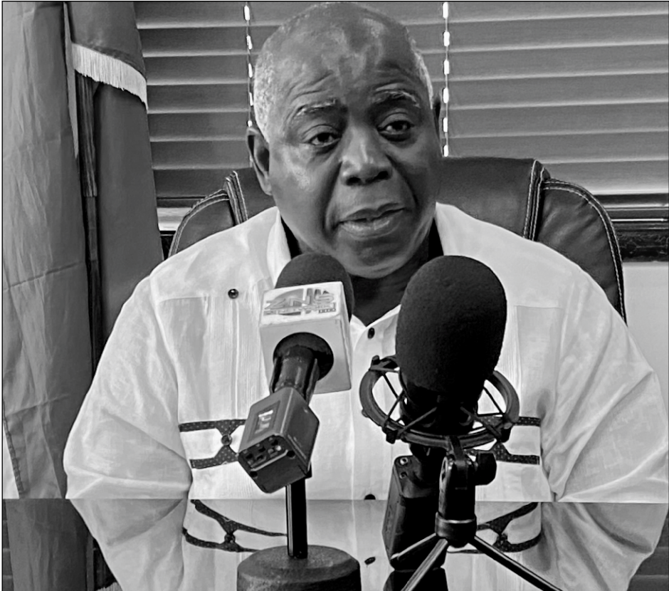
GROWING ECONOMY – Prime Minister and Minister of Finance, the Hon. Philip Davis is optimistic about the future growth of Grand Bahama’s economy and gave an update during a press conference at the Ministry for Grand Bahama on Friday, August 18, 2023.