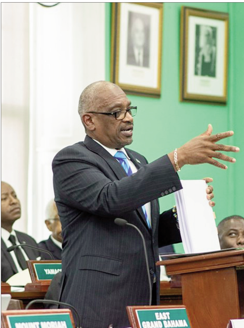
► The House of Assembly met yesterday for the first time following Hurricane Dorian. Prime Minister Dr. Hubert Minnis outlined preliminary estimates for the use of the $100 million Inter-American Development Bank loan, the Dormant Funds Account and the payout from the Catastrophic Risk Insurance Facility (CCRIF).