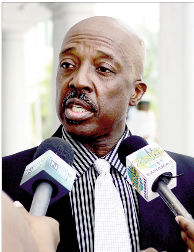
► Former Cabinet Minister Shane Gibson