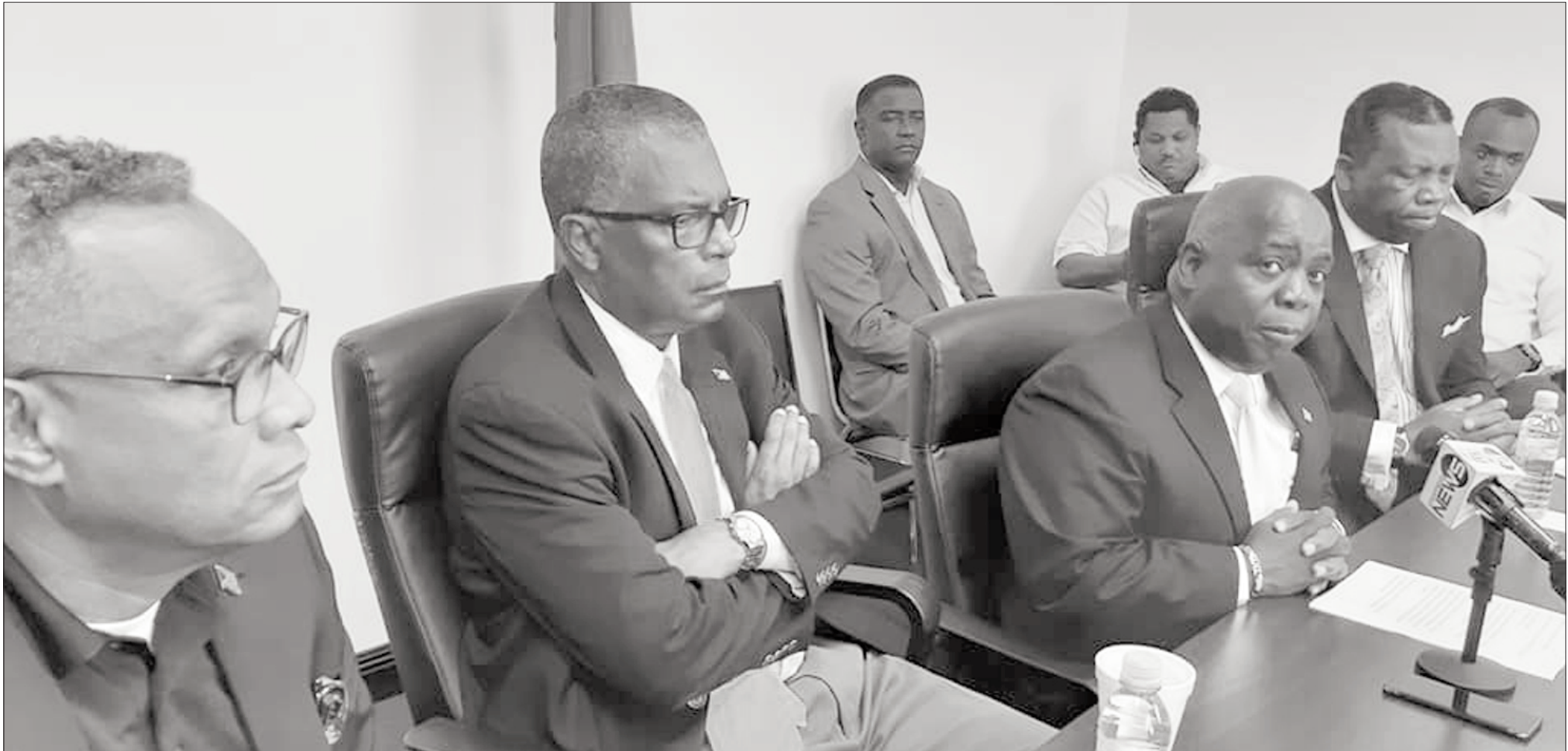
► Opposition Leader Philip Davis and other members of the opposition held a press conference yesterday to discuss the government’s post hurricane relief and restoration efforts.