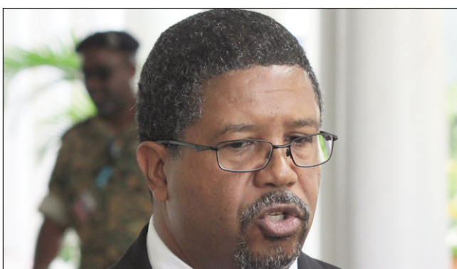
► Deputy Prime Minister and Minister of Finance, Peter Turnquest