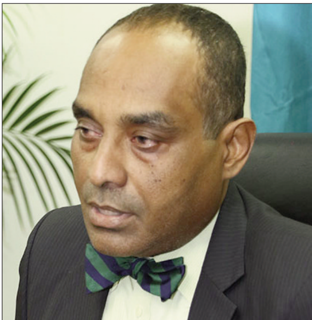
► Minister of the Environment and Housing Romauld Ferreira