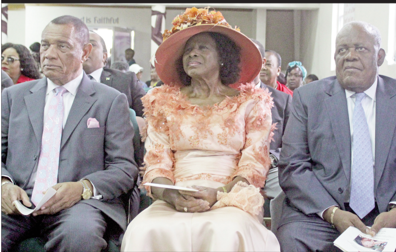
▶ Seated between two Former Prime Minister's Perry Christie (left) and Hubert Ingraham (right) Former Deputy Prime Minister, Cynthia 'Mother' Pratt received the Nelson Mandela Humanitarian Lifetime Achievement Award and the 21st Century Pan-American Change Agent Award yesterday May 16th, 2019 at her church, Prayer and Praise Assembly in Coconut Grove.