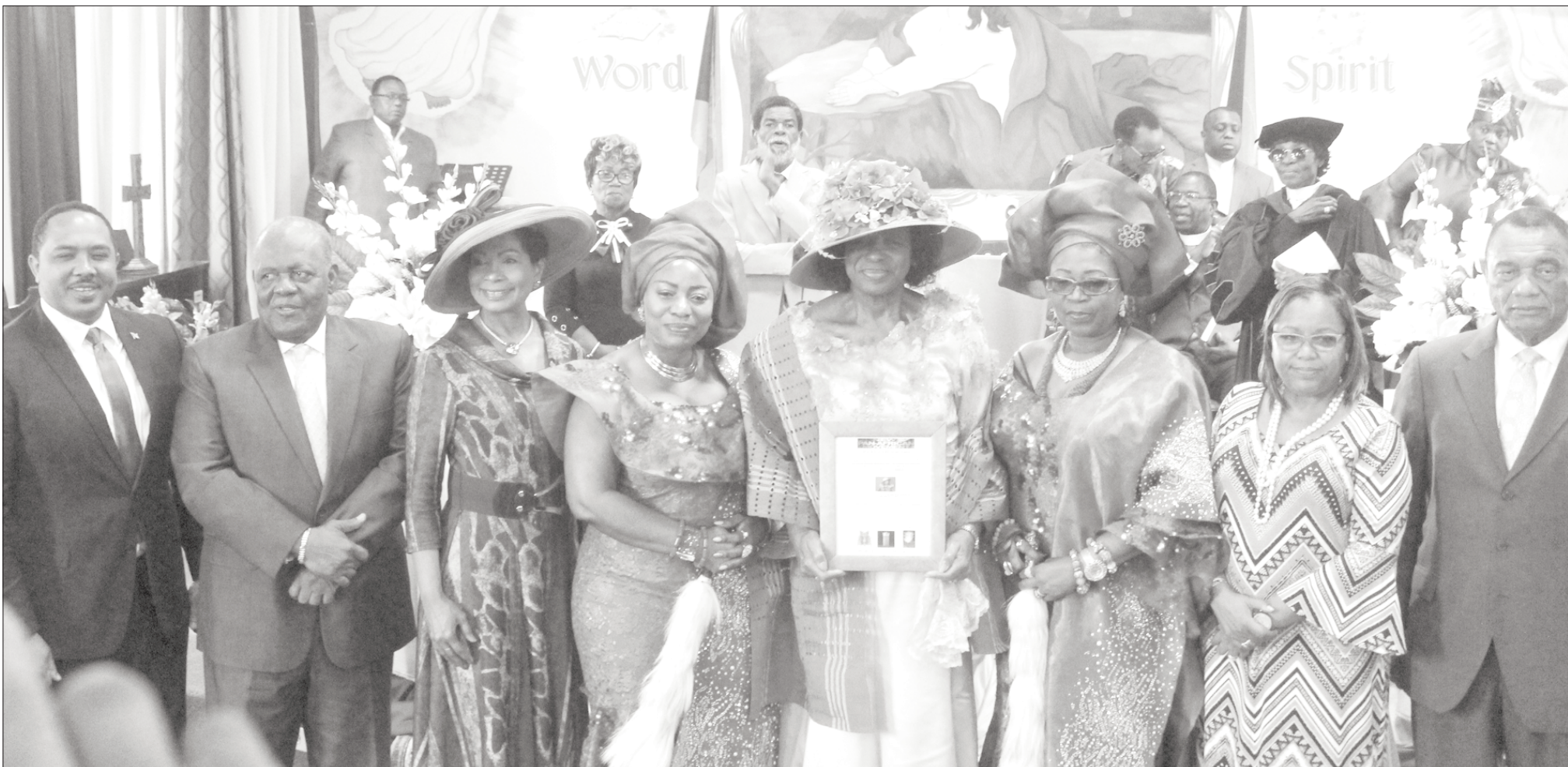
▶ Former Deputy Prime Minister, Cynthia 'Mother' Pratt receiving the Nelson Mandela Humanitarian Lifetime Achievement Award and the 21st Century Pan-American Change Agent Award. She is captured with a number of select dignitaries who attended to show gratitude for her humanitarian contributions.

A large number from the Coconut Grove and Saint Cecilia community were in attendance along with a number of prominent Bahamians.