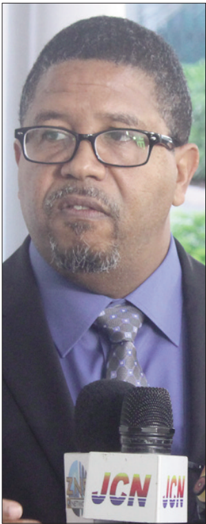
▶ Deputy Prime Minister and Minister of Finance, Peter Turnquest