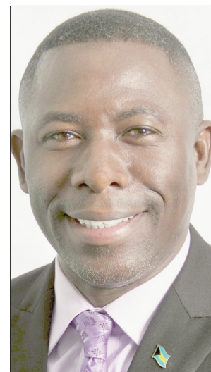
► Transport Minister, Renward Wells