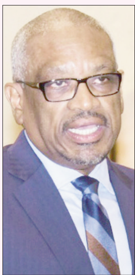
► Prime Minister, Dr. Hubert Minnis

The leaders of the two major political parties locked horns in the House of Assembly yesterday over the structure of the Royal Bahamas Police Force (RBPF) and allegations of its politicization.