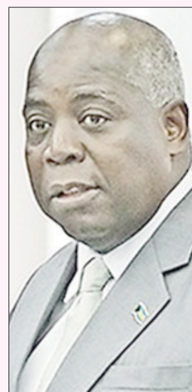
► Opposition Leader, Philp Davis