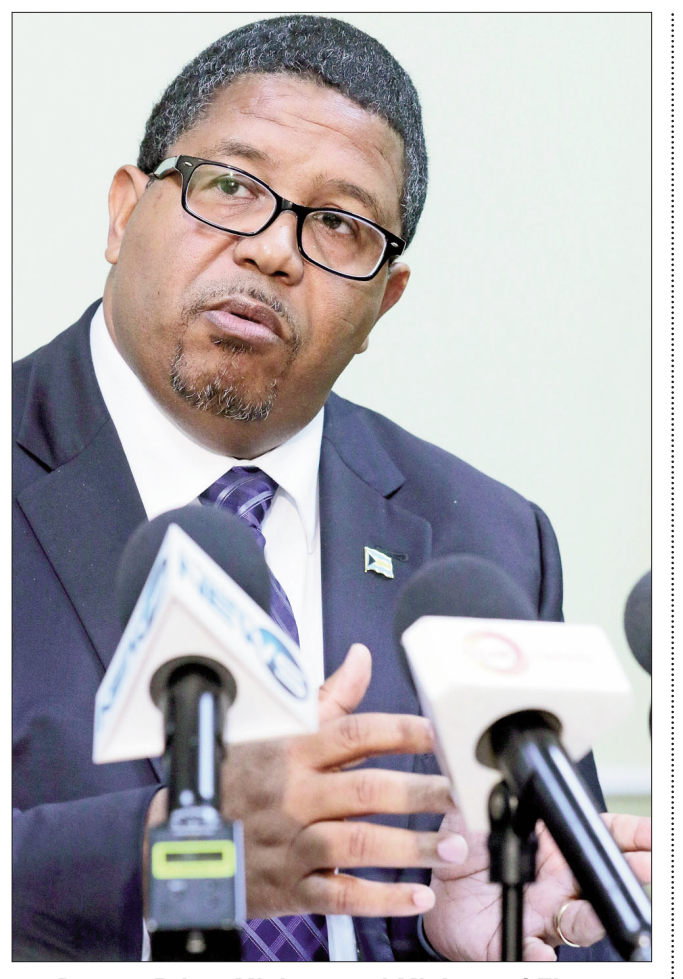
Deputy Prime Minister and Minister of Finance, Peter Turnquest

Deputy Prime Minister and Minister of Finance Peter Turnquest said in a news release that the country's fiscal perform-