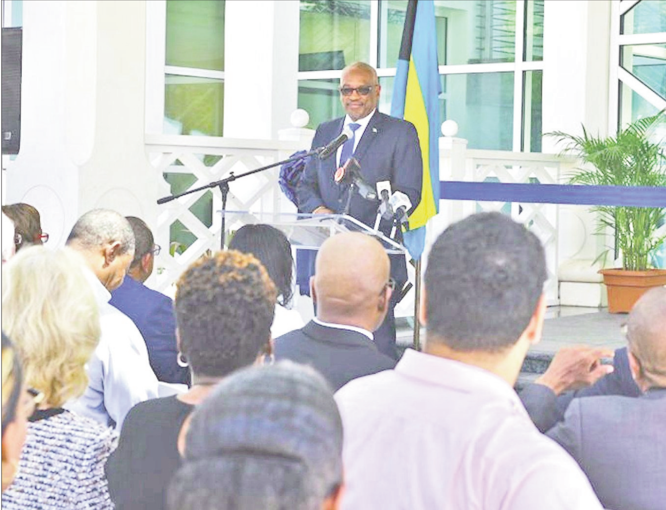
► Prime Minister, the Most Hon. Dr. Hubert Minnis on Friday, April 26, 2019 addressed the official opening and ribbon cutting ceremony for Poinciana House corporate centre on East Bay Street, which houses the Insurance Commission of The Bahamas, Securities Commission of The Bahamas, and Compliance Commission of The Bahamas, as well as other financial offices. Prime Minister Minnis said the move into Poinciana House by the various commissions opens the door to a bright future. The Prime Minister cut the ribbon and also toured the offices.