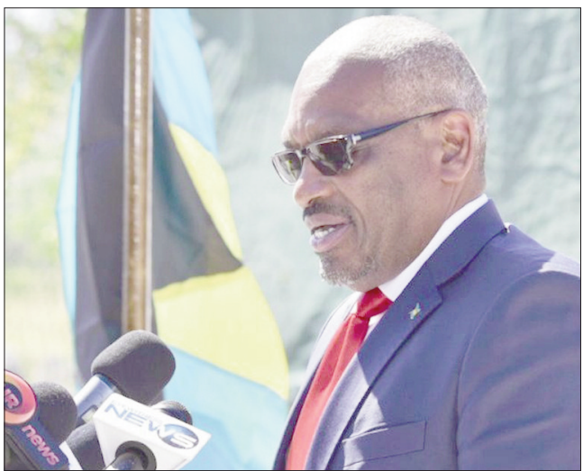
▶ Prime Minister Minnis addressing the audience at the handover ceremony in Matthew Town, Inagua

The handover of the country's first state-of-the-art coastal radar system marks an essential step in the Government's strategy to strengthen the borders of The Bahamas, Prime Minister the Most Hon. Dr. Hubert Minnis said on