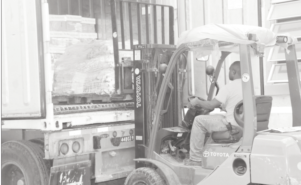
The chiller system goes from the farm to the boat at Morgan's Bluff to Potter's Cay Dock and then directly to the wholesaler.

THE Bahamas Agriculture and Marine Science Institute (BAMSI) continues to build economic capacity with the recent engagement of a refrigeration transport container that will transform its post harvesting marketing protocols, reducing spoilage and wastage by 40 per cent or more and