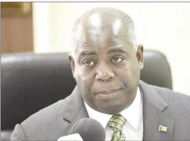
► Opposition Leader, Philip Davis

Stating that democracy is in peril in the Bahamas, the Opposition Progressive Liberal Party has taken its complaint about the conduct of two cabinet Ministers to the Caribbean Community and beyond. While it may not get a response, a letter the party wrote to the Secretaries General of the Commonwealth of Nations and CARICOM has been acknowledged.