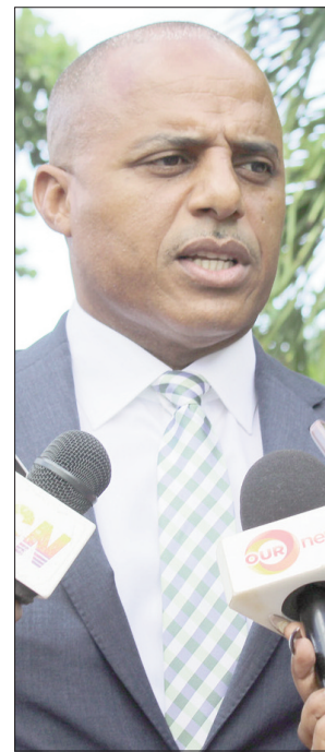
► National Security Minister, Marvin Dames

Those comments were based on what Mr. McAlpine shared on the