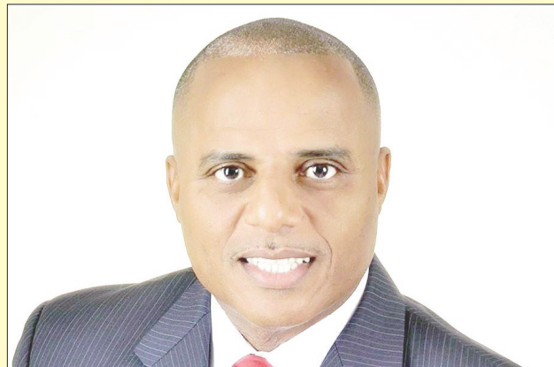
▶ Minister of National Security Marvin Dames