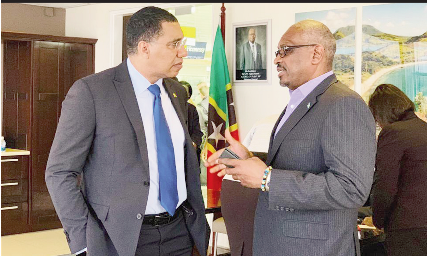
► BASSETERRE, St. Kitts & Nevis -- Prime Minister, the Most Hon. Dr. Hubert Minnis, along with Prime Minister of Jamaica, the Most Hon. Andrew Holness arrived in Basseterre, St. Kitts & Nevis, today, for the 30th Inter-Sessional Meeting of the Conference of Heads of Government of the Caribbean Community (CARICOM). Prime Minister Minnis is pictured (right) in conversation with Prime Minister Holness at the Airport VIP Lounge in St. Kitts & Nevis. CARICOM meetings begin tomorrow.