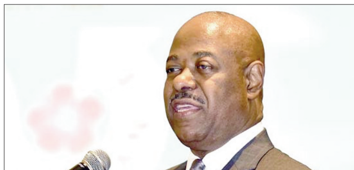
▶ Former Tourism Minister Obie Wilchcome (File photo)