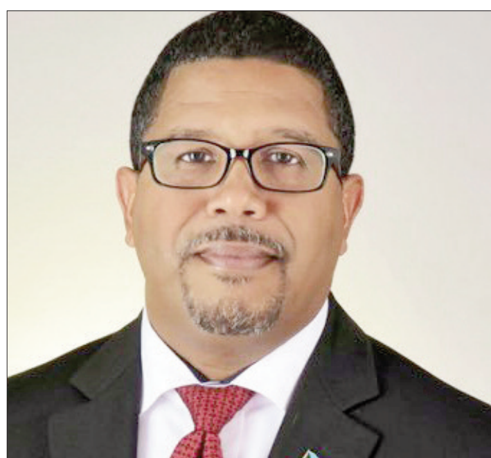
▶ Deputy Prime Minister and Minister of Finance, K. Peter Turnquest (File photo)

Addressing the 45th annual General Meeting of The Caribbean Association