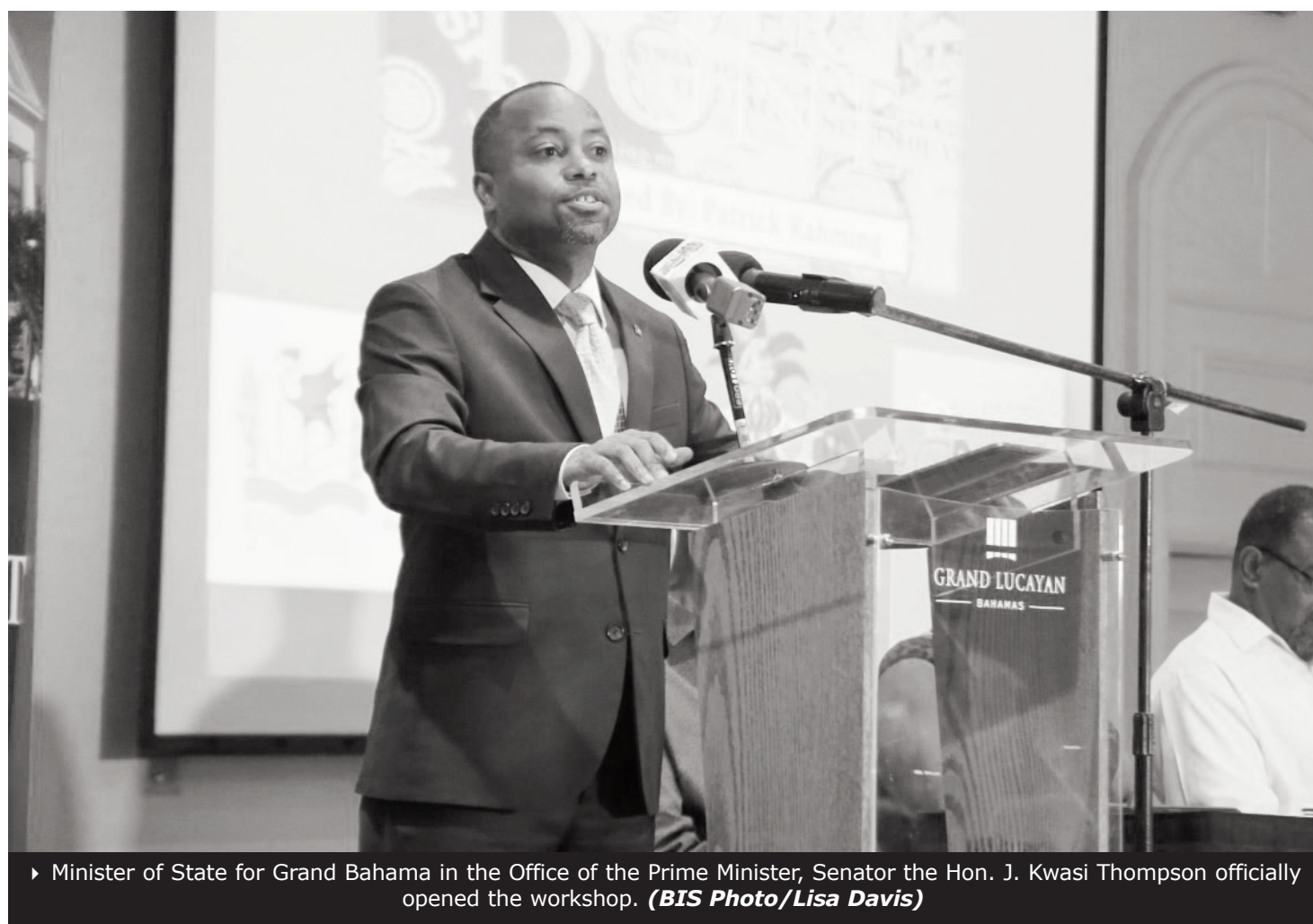
► Minister of State for Grand Bahama in the Office of the Prime Minister, Senator the Hon. J. Kwasi Thompson officially opened the workshop.

Grand Bahamians, he said, can relate to the role tourism plays in the economy as everyone has been either directly or indirectly affected by it. Tourism, he continued, is here to stay and therefore more opportunities need to be created for