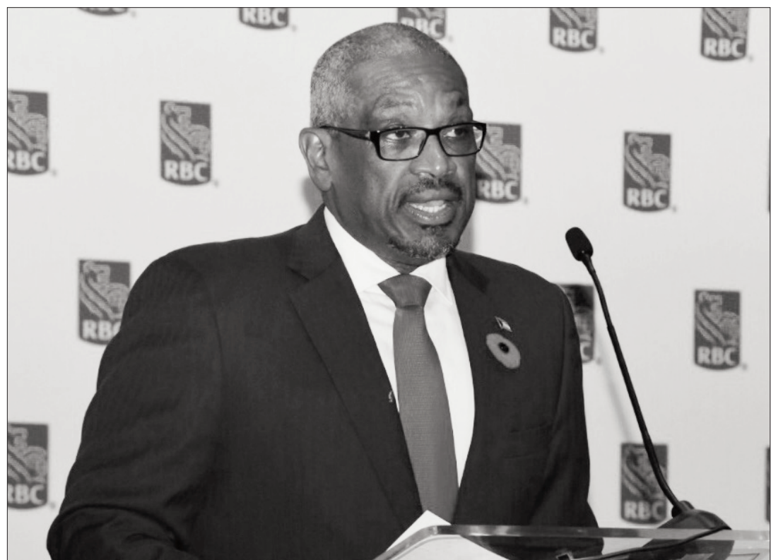
► Prime Minister, Dr. the Most Hon. Hubert Minnis addresses the RBC Re-imagining Banking reception at the Grand Hyatt, Baha Mar, October 31, 2018; also mingles with RBC executives, along with Minister of Financial Services, Trade & Industry and Immigration, the Hon. Brent Symonette.