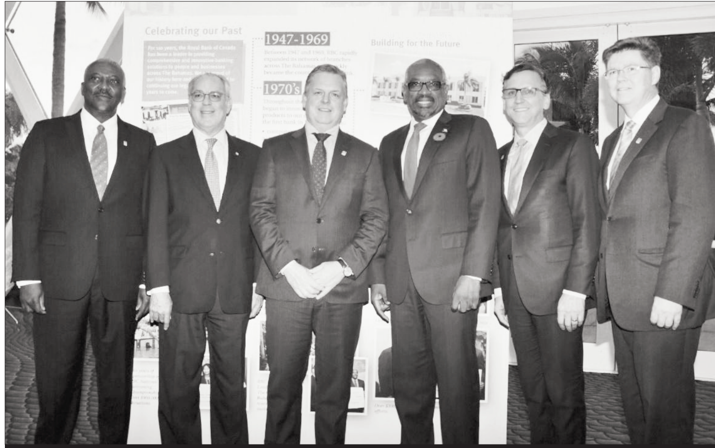
► Prime Minister, Dr. the Most Hon. Hubert Minnis addresses the RBC Re-imagining Banking reception at the Grand Hyatt, Baha Mar, October 31, 2018; also mingles with RBC executives, along with Minister of Financial Services, Trade & Industry and Immigration, the Hon. Brent Symonette.

"Royal Bank has been a significant contributor to the development and growth of the modern Bahamas," the Prime Minister said. He noted that this includes the development and financing of major projects namely: Arawak Cay Port Development, Princess Margaret Hospital Critical Care Block, the Harry C. Moore Library, Nassau Airport Development Company and the Franklyn Wilson Graduate School of Business at the University of The Bahamas.