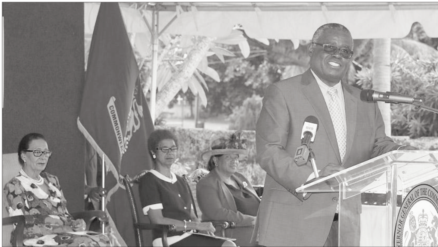
► The Hon. Brensil Rolle, Minister of the Public Service and National Insurance brings remarks during the 18th National Public Service Week, Retirees' Recognition Ceremony under the theme "The Public Service...Igniting a Positive Change for Future Generations" held on the Lower Grounds, Mount Fitzwilliam, Government House on Thursday, November 1, 2018.