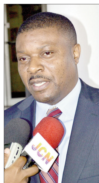
▶ Chief Negotiator for The Bahamas, Zhivargo Laing (File photo)