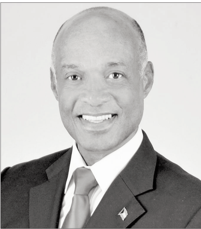
► Minister of Education, Hon. Jeffrey Lloyd (File photo)

Minister of Education, the Hon. Jeffrey Lloyd will lead an impressive list of speakers at the Second Annual Grand Bahama Technology Summit, set to take place, November 14-16 at the Grand Lucayan.