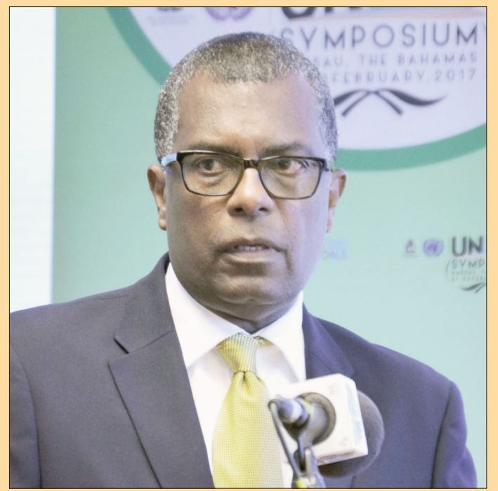
▶ PLP Chairman, Senator Fred Mitchell (File photo)

Mr. Mitchell said, "The press release by the FNM about their not so secret conclave reminds you of the line of poetry: what a web we weave when first we practice to deceive."