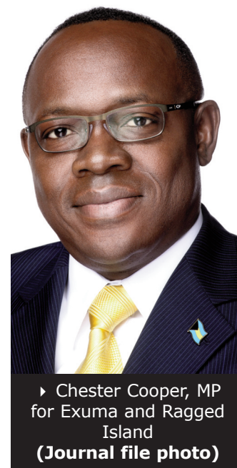
▶ Chester Cooper, MP for Exuma and Ragged Island

The Member of Parliament for Exuma and Ragged Island, Chester Cooper says purchase of the Grand Lucayan Resort by the government is not about saving the Grand Bahamian economy, as there is no clear plan presented to do that. He said, "I have heard nothing that addresses the fundamental challenges of the Tourism product in Grand Bahama." Making his contribution in a debate in the House of Assembly on a resolution for the government to borrow an