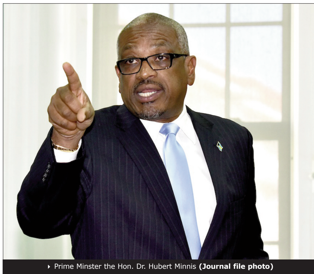
▶ Prime Minister the Hon. Dr. Hubert Minnis

P rime Minister, Dr. Hubert Minnis said yesterday that his government is "doing the right thing" with the acquisition of the Grand Lucayan Resort. In a detailed report in the House of Assembly, he went to great lengths outlining why talks with the Wynn Group collapsed and why his government instead opted to get into the hotel business and temporarily own the Resort. The government first sought to have a private group purchase the Grand Lucayan hotel, this however fell through. In July, the government