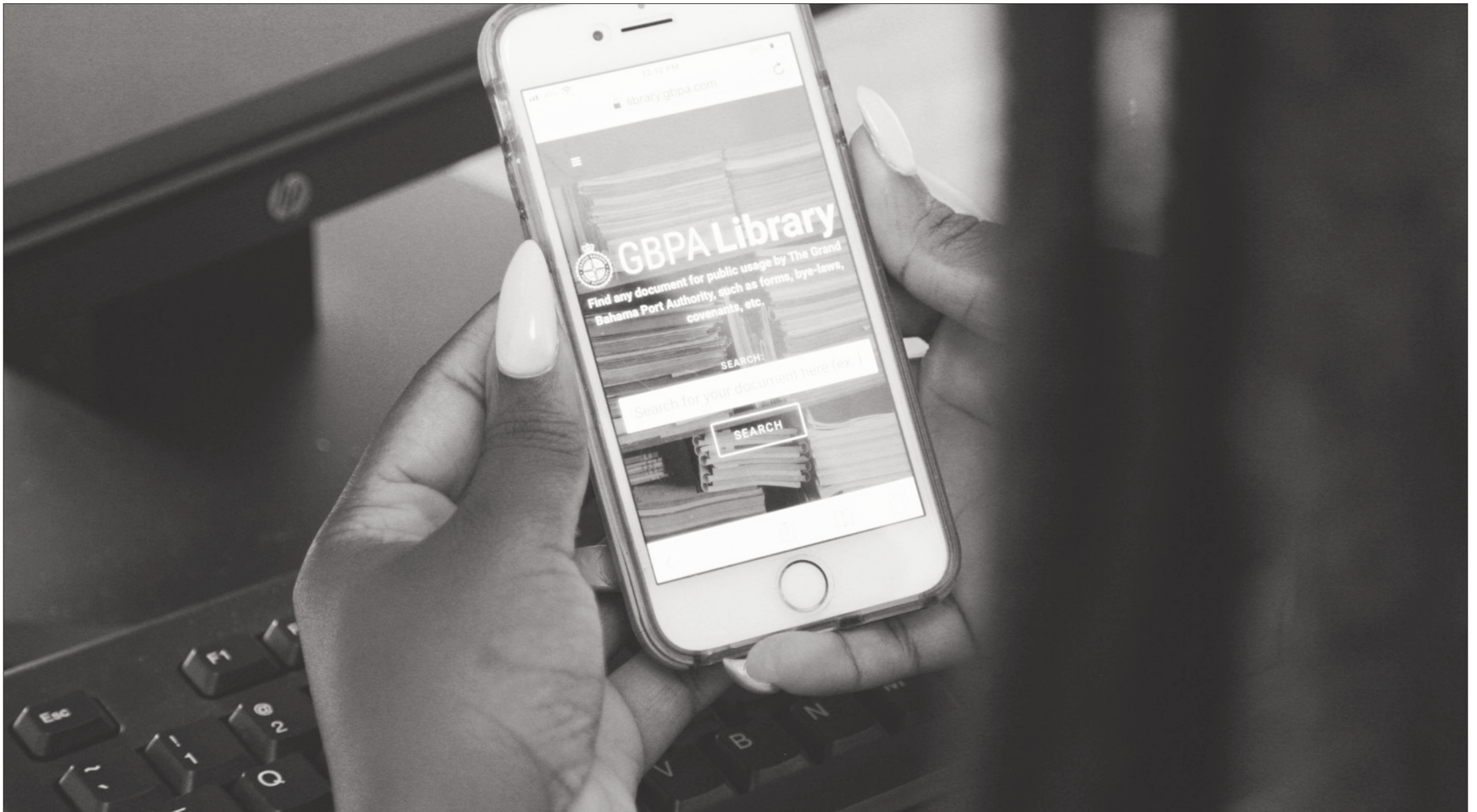
► Digital Access, In the Palm of Your Hand: GBPA launched its free digital library, allowing licensees and residents instant access to over one hundred documents, such as business license applications and procedures, and the bye-laws of Freeport. This site, which is configured for both desktop and mobile compatibility, is one of GBPA's efforts to encourage the ease of doing business within the city.

To access GBPA Library, visit https://library.gbpa.com