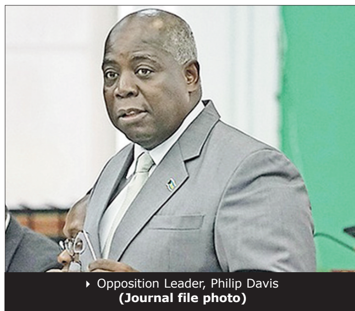
▶ Opposition Leader, Philip Davis

For the Opposition, the Grand Lucayan deal is not all the government purports it to be. Progressive Liberal Party leader Philip Davis blasted the acquisition in the House of Assembly as desperate, ill-advised and an inadequate band-aid approach to address the state of Grand Bahama's economy. "In our view, it is another