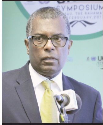
► Senator Fred Mitchell, Chairman of the PLP Party

The Chairman of the Progressive Liberal Party, Senator Fred Mitchell says "Prime Minister Dr. Hubert Minnis can be accused of being a political hypocrite if he does not act on his posturing on Immigration matters as reported in the press yesterday.