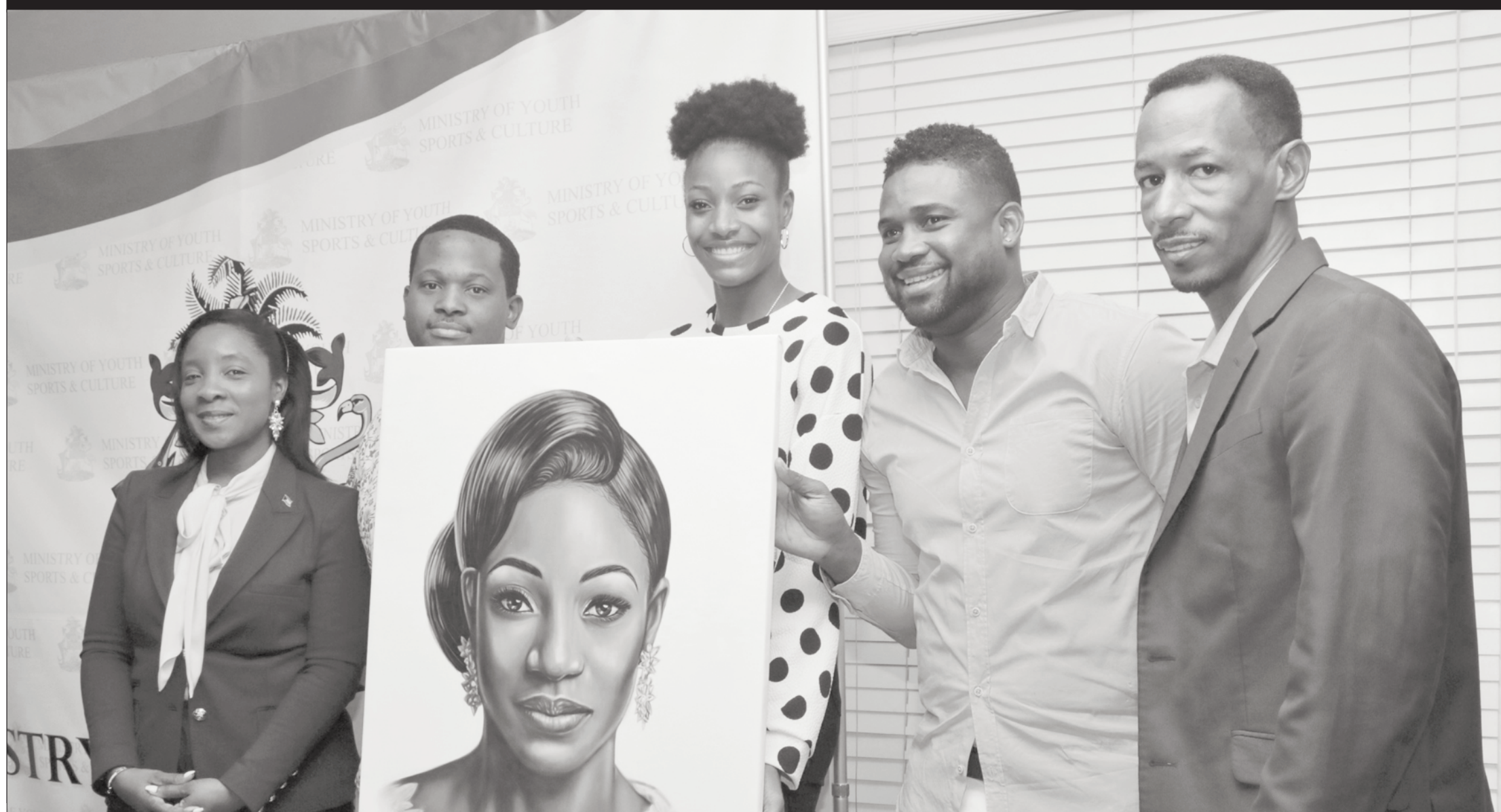
► Minister of Youth, Sports and Culture the Hon. Lanisha Rolle commemorates a "welcome home" courtesy call for Olympic Gold-Medalist and 2018 Diamond League Winner Shaunae Miller-Uibo with a celebration of live Junkanoo, Bahamian music, art, and food, at her Ministry's University Drive Head Office, on September 17, 2018.

Surrounded by cheering well-wishers and waving Bahamian flags, Olympic Gold-Medalist and 2018 Diamond League Winner Shaunae Miller-Uibo arrived at the Ministry of Youth, Sports and Culture (MOYSC) for a courtesy call that was a celebration for all present, on September 17, 2018, even those cheering and dancing to live Junkanoo music on the two floors above the building's main floor.