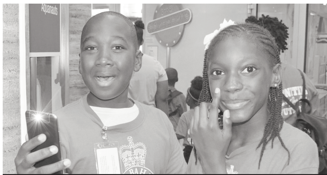
Participants of the Royal Bahamas Police Force Summer Youth Programme were excited when they came across the Science Lab aboard the Allure of the Seas during a tour of the ship arranged by Royal Caribbean.