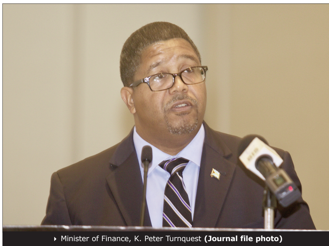
▶ Minister of Finance, K. Peter Turnquest

"To this end, the proposed Fiscal Responsibility legislation contains legally binding