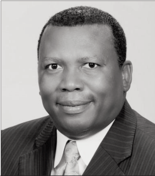
▶ MP for Mangrove Cay & South Andros, Picewell Forbes