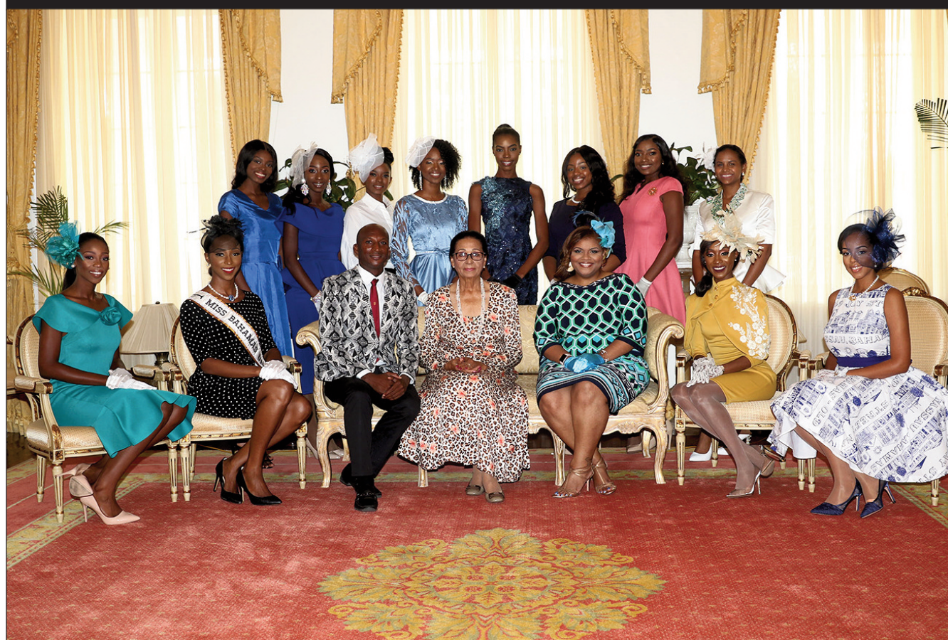
The Executive Members and Delegates of Miss Bahamas Universe Pageant 2018-2019 called upon Governor General Her Excellency Dame Marguerite Pindling at Government House on Wednesday, August 29, 2018.