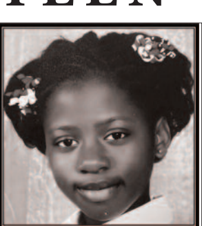
Continued from / PAGE 1...

Robinson Road, when they noticed a male standing on the side of the street, armed with a firearm. The male opened fire in their