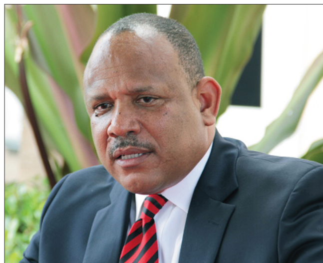
► Health Minister, Doctor Duane Sands

H ealth Minister, Doctor Duane Sands has refuted claims of rising costs for patients at the Princess Margaret Hospital (PMH) - at least not yet. "What we have talked about is the fact that in