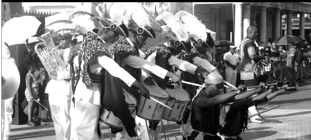
► Governor General Her Excellency Dame Marguerite Pindling attended the annual Independence celebration Beat Retreat on Sunday evening downtown in Rawson and Parliament squares. Royal Bahamas Defence Force Band gave a magnificent showing during the 2018 Independence Beat Retreat. The Bahamas celebrates its 45th Independence Anniversary on July 10, 2018.