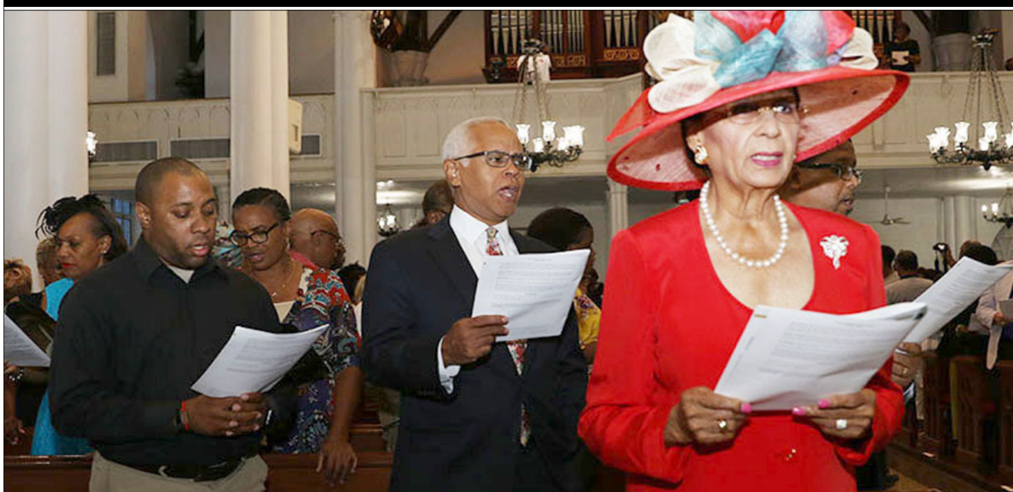
▶ Governor General Her Excellency Dame Marguerite Pindling attended the opening Eucharist of the Union of Black Episcopalians held at Christ Church Cathedral, Monday, July 23, 2018. The Union of Black Episcopalians is commemorating its 50th anniversary while it holds its annual business meeting and conference in The Bahamas