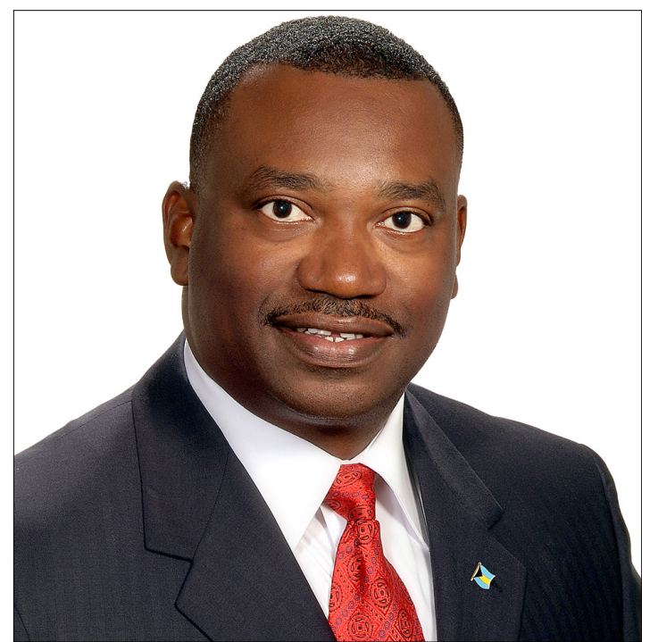
▶ The late former Cabinet Minister and Member of Parliament, Phenton Neymour

BY JAMEELHA MISSICK Journal Staff Writer