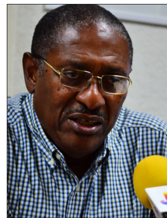
▶ Former Cabinet Minister and Member of Parliament Bradley Roberts

The letter also warned Mr. Butler that failure to comply will result in the termination of Sky Bahamas' operating license, meaning that the airline will no longer be allowed to operate within the terminals of the Lynden Pindling International