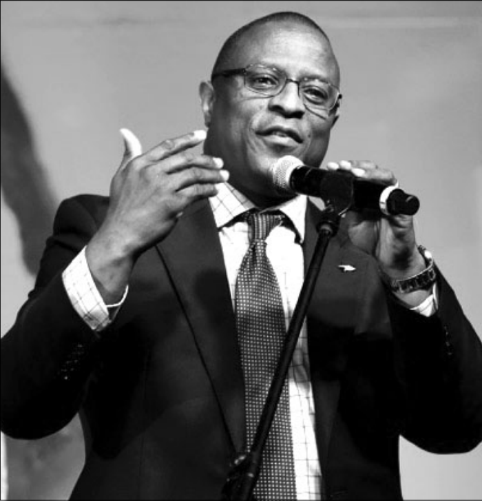
► ARTHUR'S TOWN, Cat Island -- Minister of Youth, Sports and Culture the Hon. Michael Pintard welcomed all to the Cat Island Rake-n-Scrape Festival in Arthur's Town, May 31 to June 2.