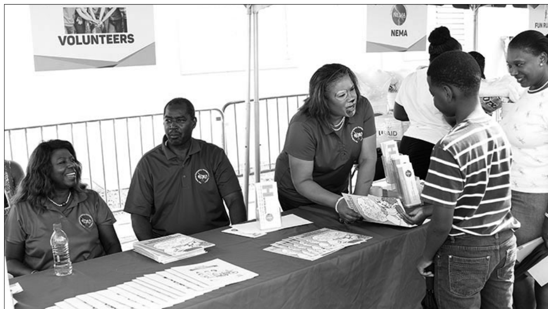
► Patrons stop at the NEMA booth for information regarding disaster preparedness and mitigation during an Exhibition mounted by the National Emergency Management Agency, NEMA on Saturday, June 23, 2018 at NEMA on Gladstone Road. The exhibition was part of NEMA's disaster awareness campaign during the 2018 Atlantic Hurricane season, which runs June 1 to November 30.