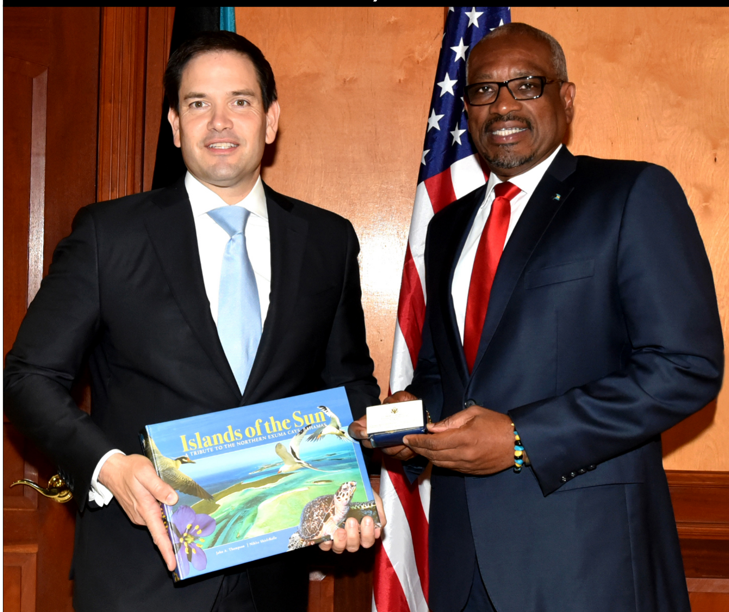
▶ U. S. Senator, The Hon. Marco Rubio representing Florida paid a Courtesy Call on Prime Minister Hon. Dr. Hubert A. Minnis today at Cabinet Office, Churchill Building. Prime Minister Hon. Dr. Hubert A. Minnis & U. S. Senator The Hon. Marco Rubio exchange of gifts.

Is your family prepared for the inevitable?