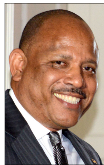
▶ Minister of Health, Dr. the Hon. Duane Sands