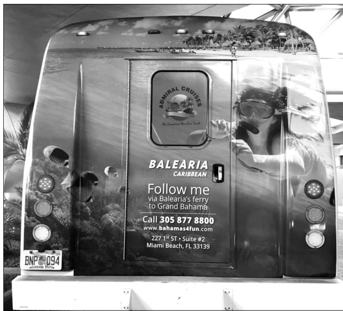
▶ Wrapped travel bus promotes Grand Bahama Island eco tour and Balearia Caribbean Cruise Line.

According to Ziad, despite environmental setbacks deriving from storms in the Caribbean in 2017, he sent 28,000 persons to Grand Bahama, 26,500 to Bimini and 3,800 two-day cruisers. Based on current trends and bookings, he projects that 2018 will far exceed previous years'