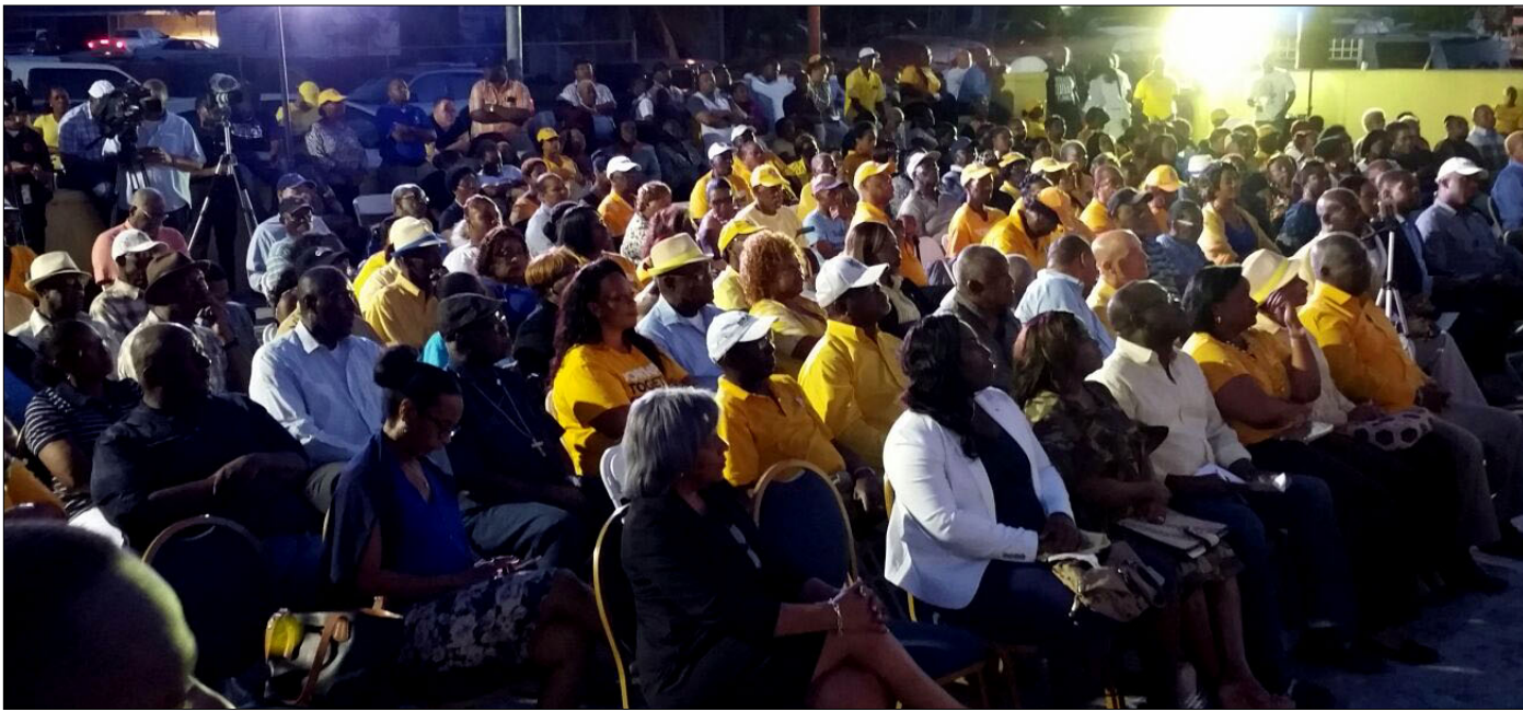
► Hundreds of supporters attend PLP Rally last night at the Sir Lynden Pindling Centre, Gambier House.

Opposition Leader Philip "Brave" Davis says the Minnis administration is operating "on a platform of falsehoods, untruths, and a tissue of lies." He said the Free National Movement government "is a danger to the rule of law."