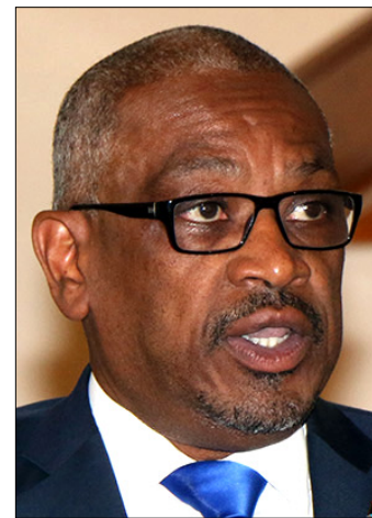
► Prime Minister Doctor Hubert Minnis