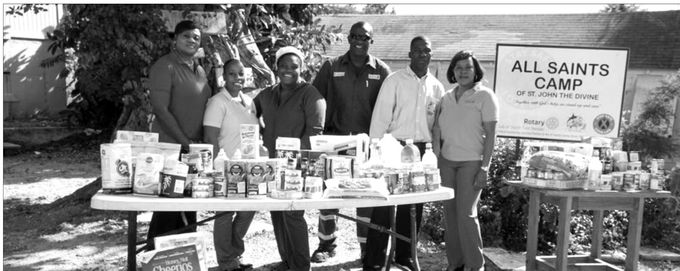
► For more than a decade, Bahamas Waste has partnered with the All Saints Camp in the fight to end HIV/AIDS in the Bahamas. On December 11, the company made its annual donation of grocery items to the facility as part of efforts to improve the quality of life for residents at the camp.