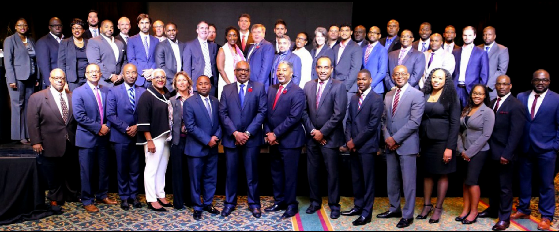
▶ PM AND DELEGATES – Prime Minister, Dr. the Hon. Hubert Minnis (centre), along with Minister of State for Grand Bahama, Senator Kwasi Thompson took time out during a break on day one of the Grand Bahama Tech Summit to take a photo with some of the key delegates and speakers. Joining the Prime Minister was Minister of Transport and Local Government, the Hon. Frankie Campbell; Minister of Foreign Affairs, the Hon. Darren Henfield; Minister for the Environment and Housing the Hon. Romauld Ferreira; President of the Senate, the Hon. Katherine Forbes-Smith; along with Parliamentary Secretaries, Members of Parliament, Grand Bahama Port Authority officials, and other dignitaries.